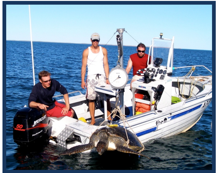
Weighing loggerhead turtle.