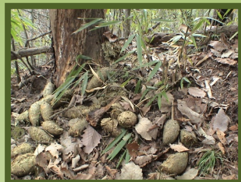
Panda sign. Droppings accumulate under a resting spot.

had turned this problem around, largely by applying what we learned in our behavioral research. Today, I reflect with pride on the accomplishments of the cross-Pacific team of researchers who met this challenge head on. Just last year 17 cubs were born into the booming panda population at Wolong! Still, I was concerned that my studies of captive pandas could only go so far in helping us learn about the nature of pandas in the wild. A field biologist at heart, I was eager to get my boots dirtier.