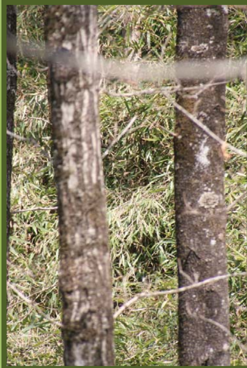
Find the panda! It's there, a typical view.

But how could I learn more about wild pandas? How could I even see a panda? Every year I made treks up into the steep treacherous mountains of Wolong. Panda signs were ample. Finding panda droppings and feeding sites was easy and I frequently located their marking trees along ridge trails. I spent days looking and each time I found fresh sign I thought my moment of truth was coming. Inevitably, I returned with memories of serene ancient spruce-fir forests, lush nearly impenetrable carpets of bamboo, and an incredible diversity of all kinds of life forms, but never the holy grail. I consoled myself that I was not alone. Many of my colleagues had the same experience. To see a panda—and study it—was going to take an extraordinary effort.