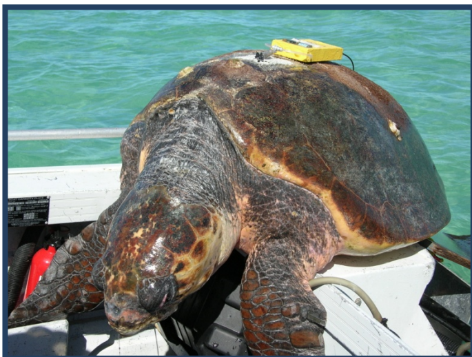
Loggerhead turtle with time-depth recorder.

students to gear their research toward important, current issues in conservation.