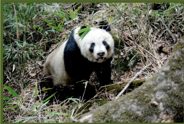
My first sighting. A panda emerges from the bamboo and looks me over.

males (the unbloodied one?) was the victor. And then the defining moment comes. One male makes his way over and is about to climb up to share my rock with me, probably just desiring to get a good whiff of me to see what I'm all about. I'm not totally comfortable with an encounter that close, so I ease off the rock. He moves off, but pauses to urinate on a tree—a message for me?