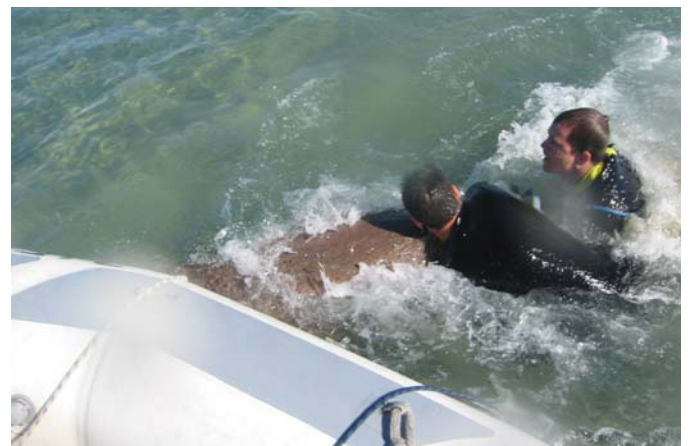
Two jumpers capturing a wild dugong in shallow intertidal waters.

Large-scale movements between seagrass habitats: Tracked dugongs were followed for periods ranging from 15 to 551 days and exhibited a large range of individualistic movement behaviors; 26 individuals were relatively sedentary (moving < 15 kilometers) while 44 made large-scale movements (> 15 kilometers) of up to 560 kilometers from their capture sites and