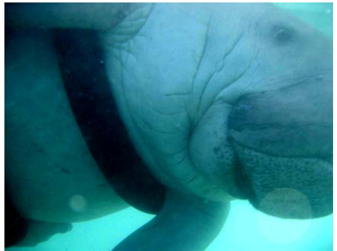
Dugong secured in a floatation device that is tied alongside the catch vessel to enable the animal's breathing to be unimpeded.

2 and 3 meters long and are long-lived (approximately 70 years) with low reproductive potential, high adult survivorship, long generation time and a high female investment in each offspring [8, 9].