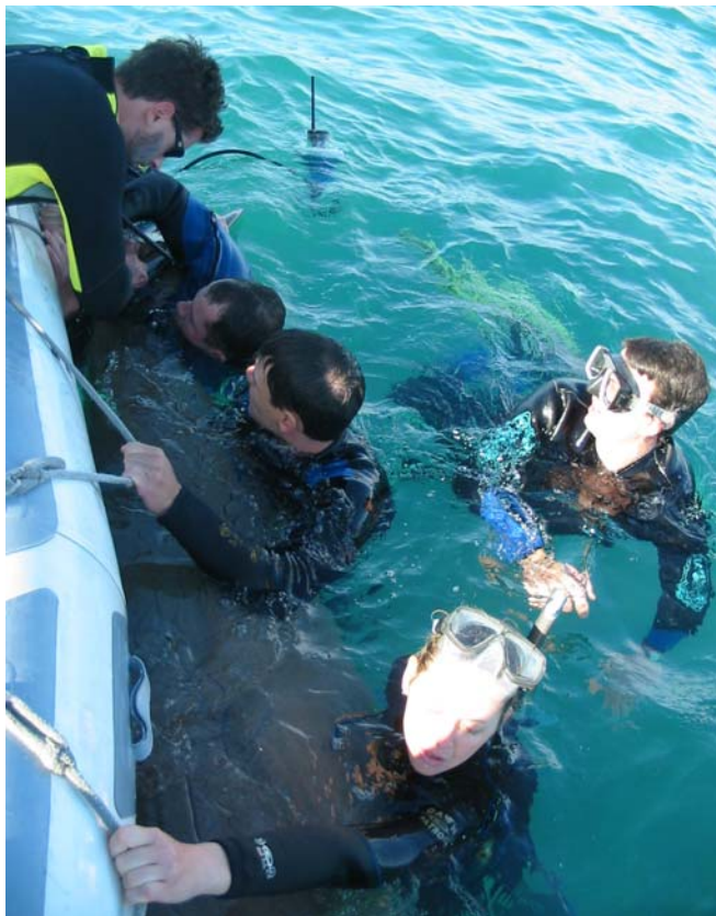
Dugong secured alongside a capture boat with the GPS-tag floating at the top of the picture.

often bypassed known dugong habitats [20]. Male and female animals, including cows with calves, undertook large-scale movements. At least some of these movements were return movements to the capture location, suggesting that such movements were ranging rather than dispersal movements. Large-scale movements included macro-scale regional movements ( > 100 kilometers) and meso-scale inter-patch local movements ( 15 \leq 100 kilometers) and were qualitatively different from tidally-driven micro-scale commuting movements between and within seagrass beds ( < 15 kilometers). Large-scale movements were rapid, apparently directed and coastal; the tracked dugongs rarely venturing more than 20 kilometers off the coast. My analysis of dive profiles suggests that dugongs make repeated deep dives while traveling (presumably tracking the sea floor) rather than remaining at the surface.