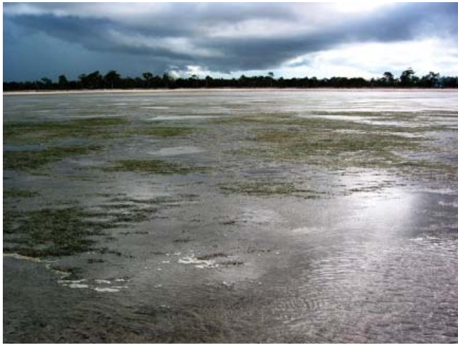
'Quality' dugong habitat on the east coast of Australia, looking back at the shore from the intertidal zone boundary at low tide. The seagrass meadow is comprised of high starch, high nitrogen, and low fiber species but is unavailable to foraging dugongs twice daily due to tidal periodicity.

of individual bays; (2) at a landscape-scale ( < 10\,000\text{ km}^2 ), dugongs select seagrass pastures within bays along the coast comprised of nutritious plant species; (3) at a local-scale ( < 10\text{ km}^2 ) within seagrass pastures that are within bays along the coast, dugongs select seagrass patches on the basis of their nutrient concentrations. I recommend that the appropriate scales at which to manage dugong populations and their seagrass habitats are coordinated within and across the hierarchical scales of habitat use indicated by my analysis.