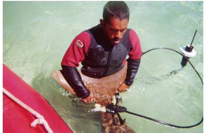
Field assistant securing a captured dugong with a GPS-tag attached to its tail.

Social cues may also be driving these behaviors. For example, male dugongs may be following estrous females. Intraspecific social dominance hierarchies and competitive exclusion may preclude subordinate animals from occupying certain seagrass habitats. Another plausible explanation for dugongs bypassing seemingly high-quality habitat and for the individual variability in the range of areas used by different individuals is that movements are learned behaviors, reflecting the individual's experience as a dependent calf.