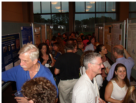
Poster session in full swing at the 2010 ABS meeting in Williamsburg.

Consider helping the Animal Behavior Society earn up to 7.5% on your purchases by ordering your books and other qualifying products from Amazon.com (up to 5%) or Powell's Bookstore (up to 7.5%) using the links found here: http://animalbehaviorsociety.org/abs-media/abs-books/ .