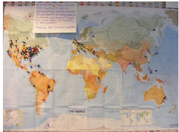
Visual representation of diversity of attendees at 2010 ABS meeting: nationality and country of residence

Participants from a total of 40 countries (of origin or travelling from these countries) and all continents attended the 2010 ABS meeting in Williamsburg, Virginia. The ABS Diversity Committee provided a world map with push-pins for participants to indicate their country of origin. The results were fascinating and very instructive. For example, we had several attendees each from the Philippines, China, Turkey and Australia, and many from various countries in Western Europe. After the U.S. and Canada, Latin America had the largest number of attendees, with at least 11 countries represented. Some of the participants were international students attending U.S. universities, but others had flown in directly from their respective countries. Since no penguins were seen attending sessions or waddling around during the coffee breaks, we assume that the 2 individuals who indicated Antarctica as their "country of origin" actually work in Antarctica and flew to ABS from there. In summary, ABS appears to have gone global, making inroads in many countries from which we previously had little to no representation. This is an indication of the health of our field and our Society and represents a trend that we hope will continue and accelerate in the future.