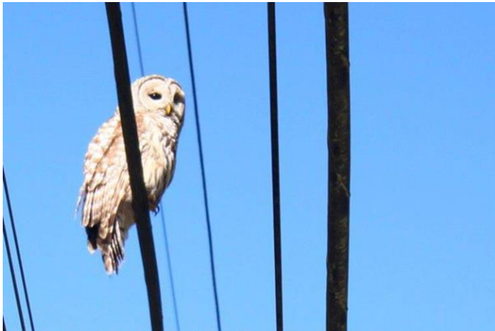
Barred Owl ( Strix varia)