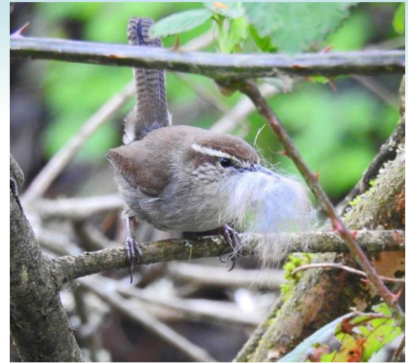
Bewick's Wren ( Thryomanes bewickii )

We're in the process of designing fun, family-friendly trail walk protocols for the public to record bird species and behavior in our parks. To facilitate this, we're designing a web presence with our protocols, bird identification resources, trail maps, training videos, and virtual bulletin boards where people can post their local sightings.